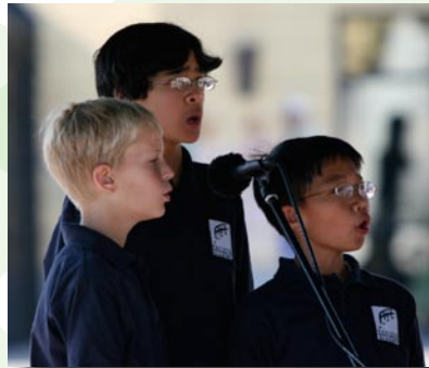
Left and below: Trouveres sing at Jack London Square.