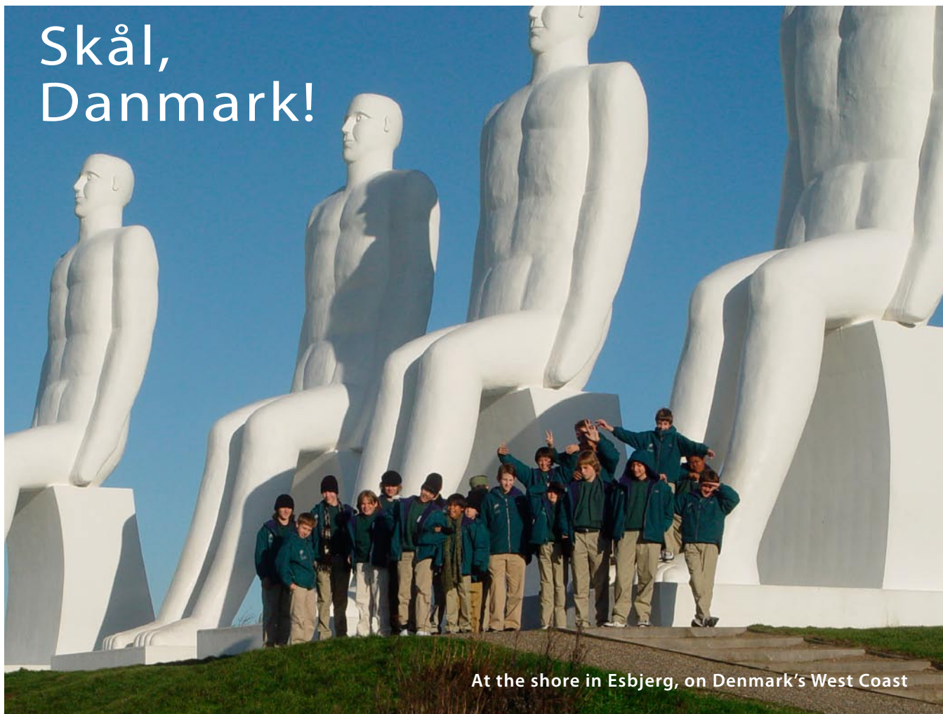
At the shore in Esbjerg, on Denmark's West Coast